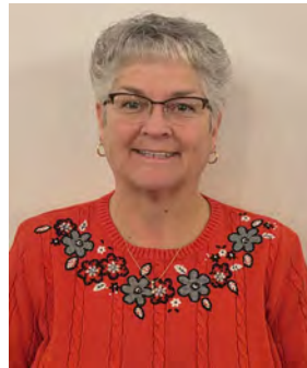
1st Vice District Governor