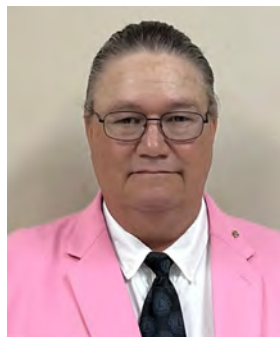
2nd Vice District Governor