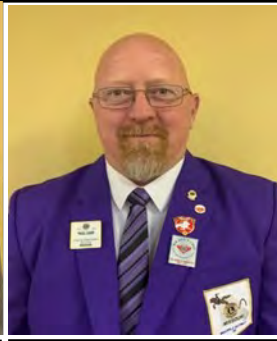
2nd Vice District Governor