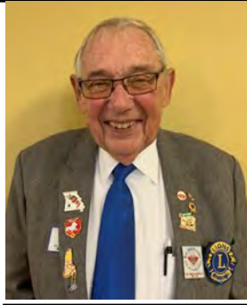
1st Vice District Governor