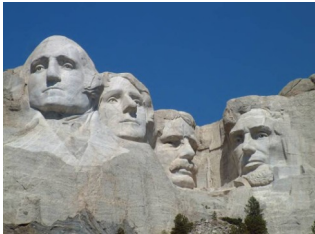
HEADIN' WEST IN 2012

Missouri Lions All - State Band 2409 B Hyde Park Road Jefferson City, MO 65109 (573) 635-1773